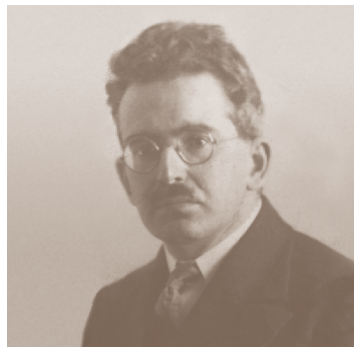
Walter Benjamin c. 1928

Associació Passatges de Cultura Contemporània info@passatgescultura.org +34 660 82 70 23 www.passatgescultura.org